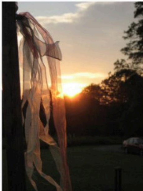
ABOVE Festive sunset