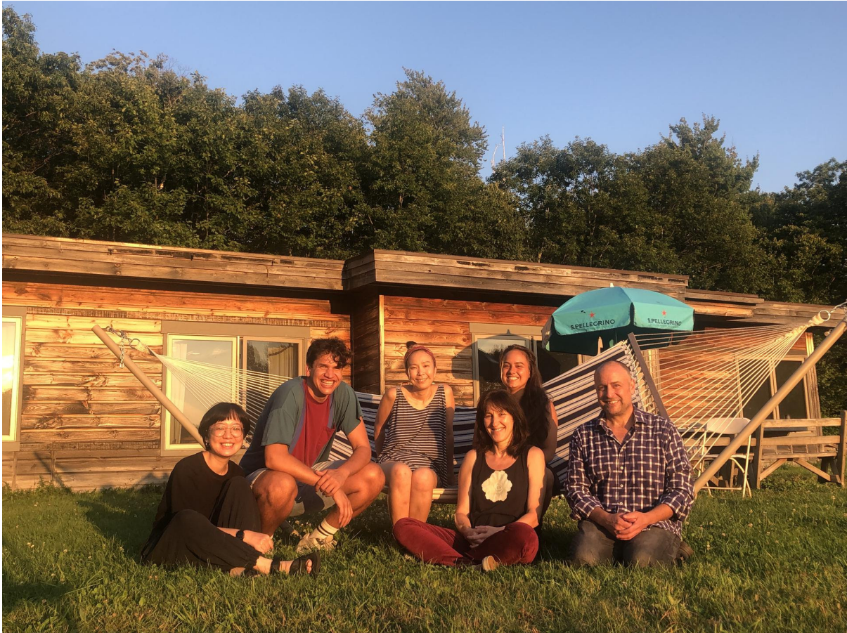
August 2020 Artists in Residence

We are extremely pleased to be present our inaugural PRIDE Issue of Barnswallow . We cherish the rich array of voices and experiences that our diverse alumni offer, a foundational hallmark of our residency program since its inception, and one we continue to expand and deepen, in terms of inclusivity as well as equity.