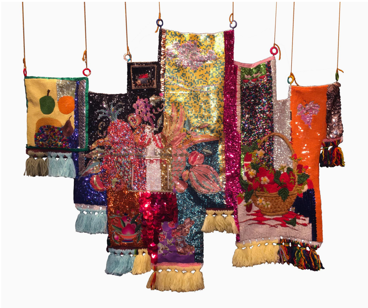
Larry Krone, Then and Now (Fruit) , 2019

"Variations for the End of the World" is an essentially cyclical piece, consisting of four variations on a simple progression of chords built around saxophone multiphonics. The piece begins in ennui, moves through songful rumination, deepens in unease, and culminates in a rumbling, overpowering climax. Finally, the music drifts apart into pieces, scattered remains spiraling outward into the void.