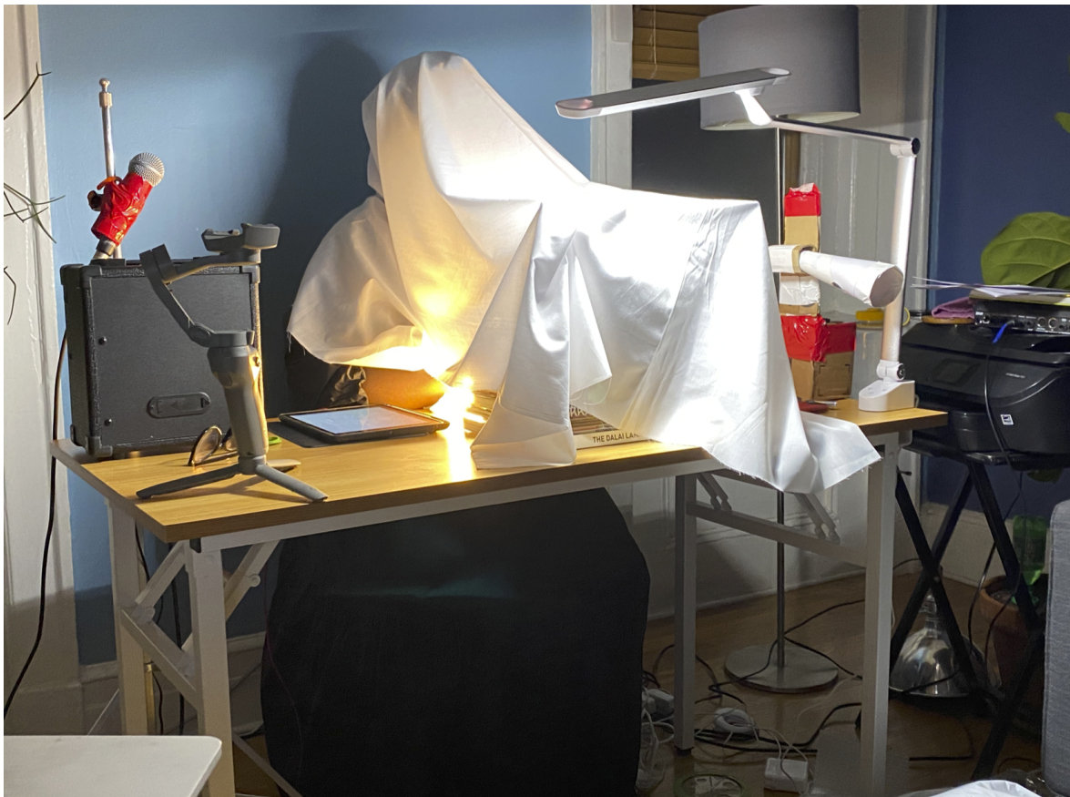
Autumn Knight, Untitled Study The Kitchen, 2020